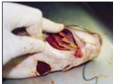
Figure 1. Yellow pigmented columnaris bacteria have infected the gills of this channel catfish, causing erosion.

Fish with columnaris usually have brown to yellowish-brown lesions (sores) on their gills, skin and/or fins. The bacteria attach to the gill surface, grow in spreading patches, and eventually cover individual gill filaments (Fig. 1). This results in cell death. Portions of the gills are eroded by protein- and cartilage-degrading enzymes produced by the bacteria. Skin lesions produced by columnaris initially are very shallow and may appear as an area that has lost its natural shiny appearance. More