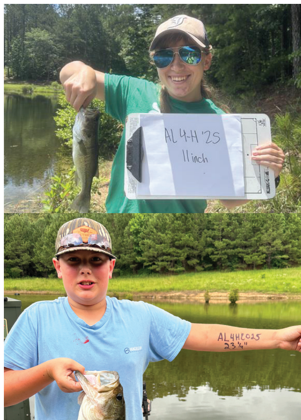
Figure 1. Examples of contest entries

Biggest Fish Art —Portray a native darter (see list) in a piece of art.