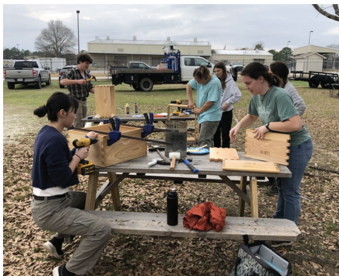
Figure 4. Winter may not be spent with bees but in building and fixing equipment.

Winter is downtime, with few active inspections needed, but it provides opportunity to build and fix equipment (figure 4). Winter is also a good time to reflect on the past beekeeping season. Which time points were important? What worked and what did not work for you? With this information, you can create a tentative schedule for beekeeping tasks in the subsequent year.