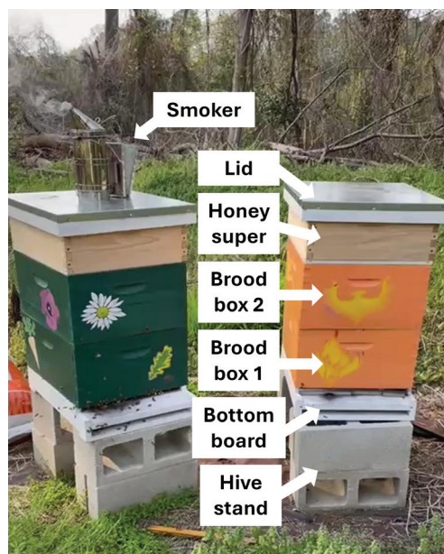
Figure 1. Two newly established colonies housed in two brood boxes with honey supers.

The upfront costs to start beekeeping can be substantial. You can expect your first-year beekeeping budget to be approximately $1,000 at a bare minimum.