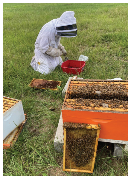
Figure 3. Beekeeping activities vary by season. After the main nectar flow, colonies should be inspected monthly to ensure that they are healthy.

Colonies that burst from every seam have a natural urge to swarm. When this happens, about half of the honey bees leave with the old queen to start a new colony somewhere else. To prevent swarms and the settling of bees in your neighbor's tree, beekeepers need to add hive boxes or artificially split colonies in half.