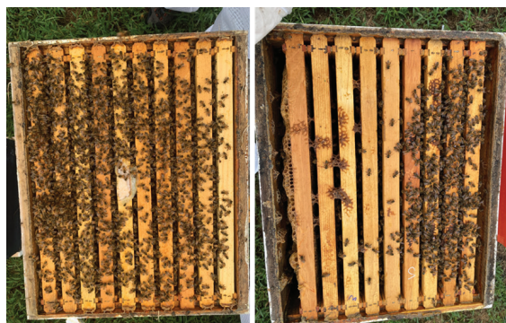
Figure 2. Colonies of different sizes. It is common to see large bee populations (left) in spring and summer. Small bee populations (right) during that time may indicate a problem.

One full-sized colony, including bees and two brood boxes with the necessary accessories, costs approximately $350, and at least two hives are recommended ( 2 \times \$350 = \$700 ). Managing two colonies gives you the chance to compare them to each other and recognize unusual colony conditions (figures 1 and 2).