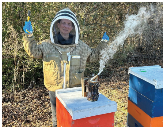
Figure 6. Beekeeping can be frustrating at times.

It is estimated that during the last 5 years, United States beekeepers lost an average of 45 percent of their colonies each year. There was no single reason why colonies died, but it was rather a combination of factors, including parasites, diseases, pesticides, and nutrition. Keeping honey bee colonies alive can be difficult, and you may lose some throughout your beekeeping journey (figure 6).