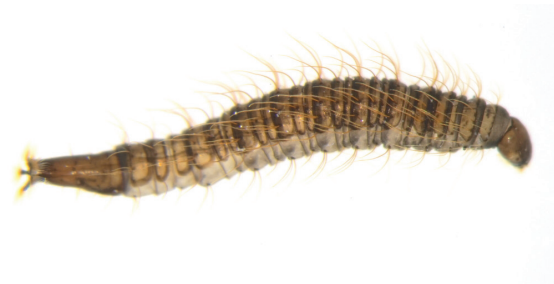
Figure 3. Drain fly larva.