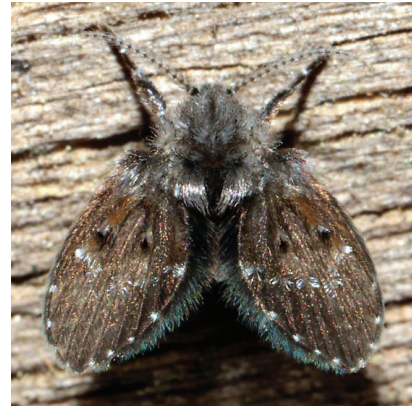
Figure 2. Adult drain fly.