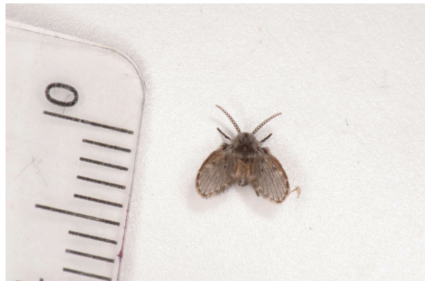
Figure 1. Adult drain fly.