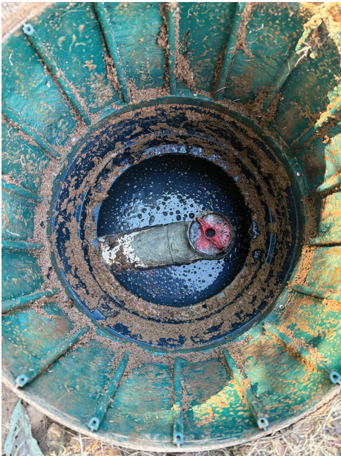
Figure 6. Septic tank.