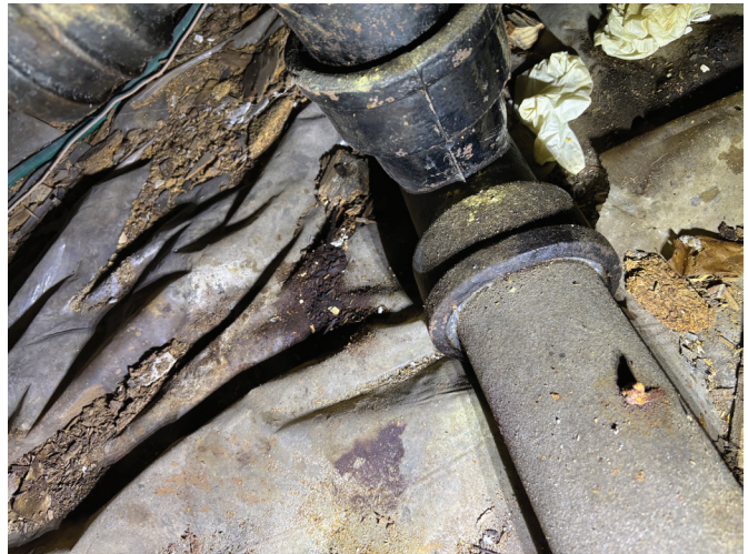
Figure 5. Leaking pipe.

Following are the most common breeding sites outdoors: