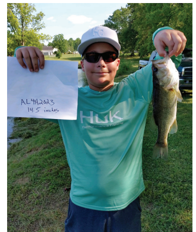
Figure 1. Example of a contest entry.