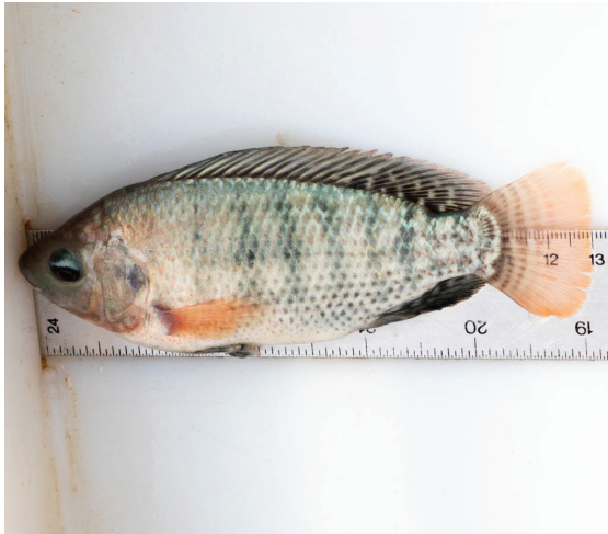
Figure 2. Measure from the tip of the snout to the end of the caudal (tail) fin to get the total length.