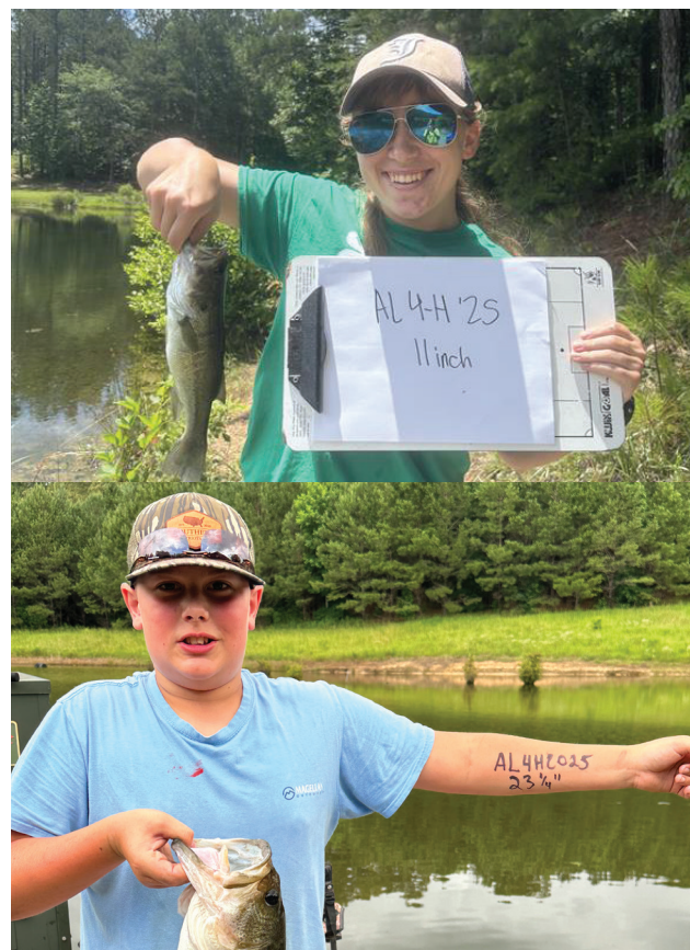
Figure 1. Examples of contest entries

Biggest Fish Art —Portray a native darter (see list) in a piece of art.