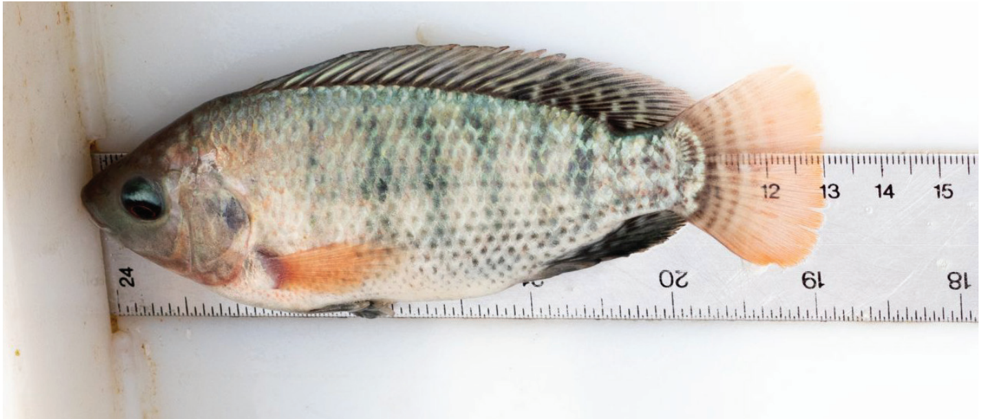
Figure 2. Measure from the tip of the snout to the end of the caudal (tail) fin to get the total length.