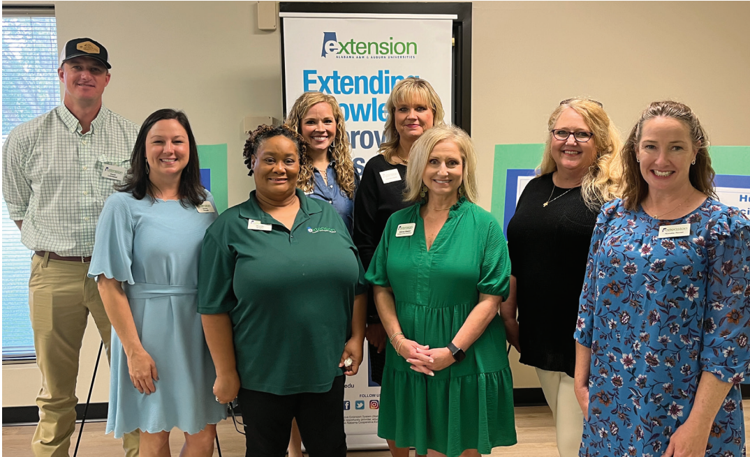
Autauga County Staff