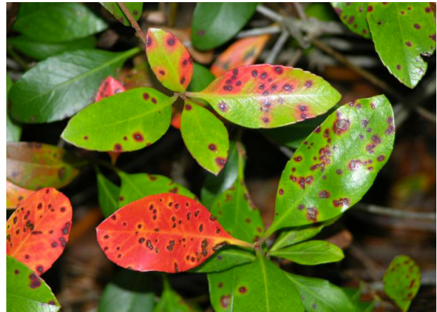
Figure 2. Bright red leaf spotting associated with Entomosporium leaf spot on Indian hawthorn.