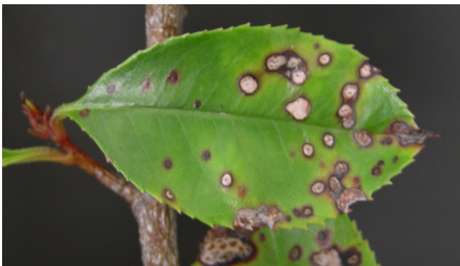
Figure 1. Typical leaf spot symptoms on photinia

Leaf spots on mature leaves are often sunken with ash brown to gray centers and a distinctive deep red to maroon margin. On pears the spots have a thin brown margin.