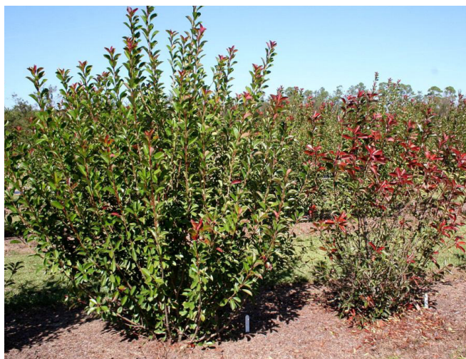
Figure 4. Leaf spot-incited defoliation on red tip photinia (right) compared with fungicide-protected red tip photinia (left)

of Indian hawthorn that consistently suffer severe disease-related leaf drop are 'Pinkie', 'Harbinger of Spring', 'Enchantress', 'Heather', 'White Enchantress', 'Springtime', and 'Spring Rapture'. These cultivars are so sensitive to Entomosporium leaf spot that they may require routine preventive fungicide sprays in the winter to preserve their health and beauty.