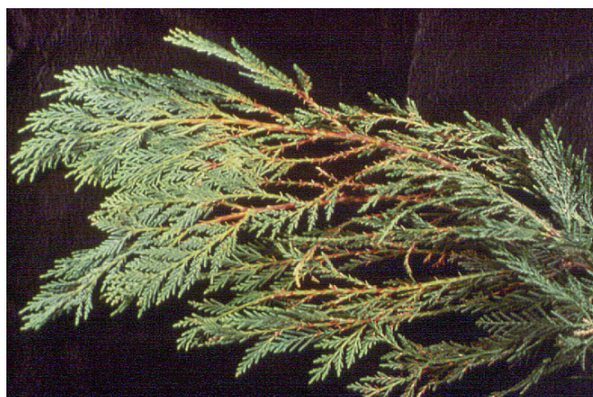
Figure 1. Yellowed foliage on branch of Leyland cypress damaged by Seridium canker.

Seridium canker was first described in the mid-20s on Monterey cypress in California. Within 20 years, a dieback and canker disease caused by the fungus Seridium cardinale devastated stands of this tree in the hot and dry Central Valley of California. During the same time frame, native stands of this tree along the cooler and wetter California central coast suffered little if any disease-related damage. In the mid-80s,