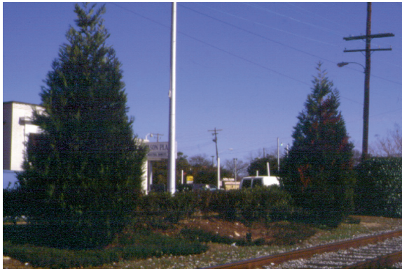
Figure 3. Bot canker: limb dieback in landscape planting of Leyland cypress

None of the cultivars or selections of Leyland cypress that are available to the nursery industry are known to be resistant to Seridium canker. When planted in areas with hot, dry summers, Monterey cypress is also highly susceptible to this disease. Although eastern red cedar is susceptible to Seridium canker, this disease has been responsible for little if any damage on this hardy tree in Alabama. Arborvitae, Japanese cedar, Lawson cypress, and Sierra juniper are resistant to Seridium canker, and an additional 12 evergreens have partial disease resistance.