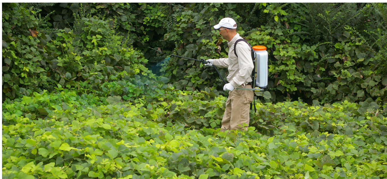
Spraying kudzu with a backpack sprayer is an effective application method in residential areas.

Controlling kudzu near your house will likely reduce the number of kudzu bugs and the foul chemical smell they emit when found in high numbers in kudzu patches or soybean fields. However, kudzu bugs can fly for several miles and some may still find your home. Kudzu bug populations continue to increase across the southeastern United States, and they are likely here to stay.