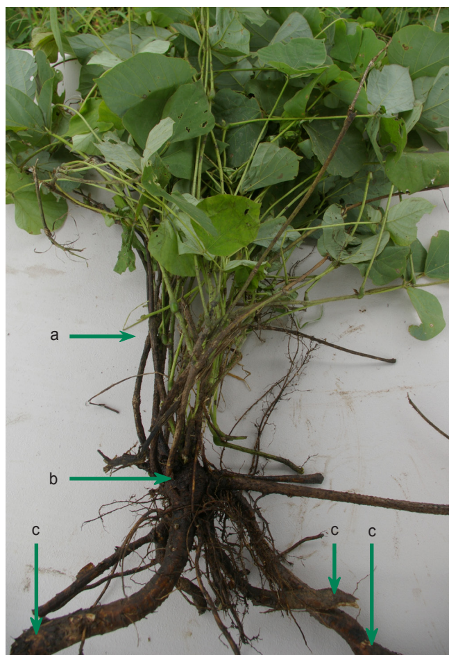
Kudzu vines (a) originate from the root crown (b). The tubers (c) are storage organs found beneath the root crowns.

For foliar treatment, the optimal timing is in the late summer or early fall. However, a single annual treatment is not sufficient. A better approach is to treat kudzu in the late spring or early summer after the leaves have fully expanded. Then apply a second treatment in the late summer or early fall to new kudzu growth that has emerged after the first treatment. This approach will be more effective than waiting until the late summer to start a control program. For cut stump treatment, late summer or fall is very effective. However, cut stump treatments