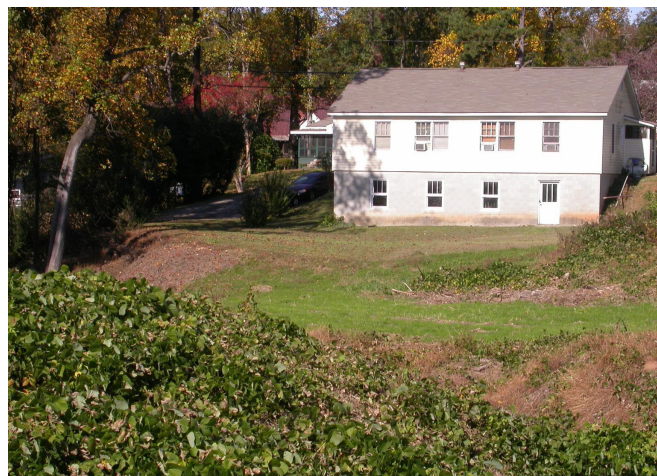
Kudzu infestation in a residential area.

To control kudzu by repeated mowing or cutting, you must do two things. First, cut every vine to the ground. This is difficult for rotary mowers as many vines lie flat on the ground. Simply cutting kudzu back (pruning or trimming) to keep it out of the lawn or at your property edge will not provide long-term control. Second, repeated cutting or mowing must continue until kudzu no longer regrows. This technique may take two to three years of repeated mowing or cutting every week during the summer. Kudzu can tolerate occasional mowing or trimming, but it does not tolerate weekly defoliation to the ground. If you start a mowing or cutting regime but do not follow through for a few weeks, the kudzu will regrow.