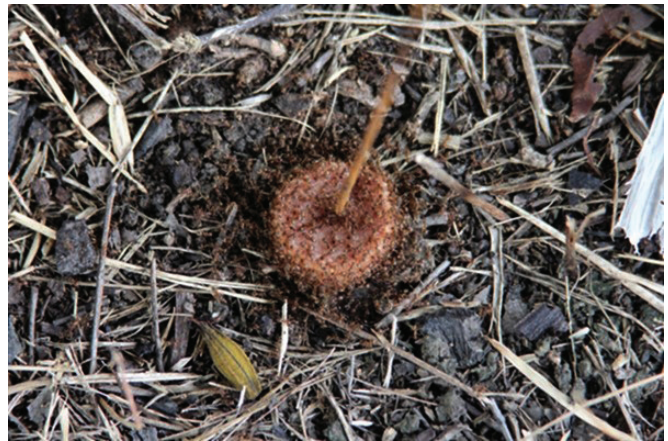
Figure 6. Tawny crazy ants on a hot dog.

In the event of a positive tawny crazy ant infestation, take a multifaceted approach to treatment. Chemical treatment alone often will result in failure. Large populations of tawny crazy ants are difficult to control, and in many cases, suppression is the only option. Control becomes more realistic with new smaller populations, which makes it imperative to regularly monitor for new infestations. If ants are discovered in containerized plant material, apply contact drenches with chemicals such as bifenthrin to infested containers. A multi-tactic approach will provide the greatest level of control when trying to manage an established infestation. Follow any ant trails to the nesting sites (figure 7) and use additional drench treatments there. Utilize barrier spray applications within the restrictions of pesticide labels to vertical surfaces such as tree trunks, sheds, and shade houses. Unfortunately, traditional pyrethroid insecticides work fast but last only a week or two, so you must use multiple applications. Apply slower acting nonrepellent insecticide sprays to areas where ants are active.