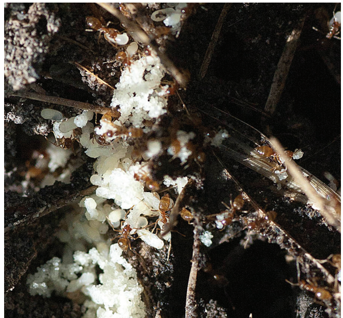
Figure 7. Tawny crazy ant brood and workers in a nest

Along with chemical applications, cultural practices include the removal of harborages such as leaf and pruning litter, pot piles, and ground cloth. When feasible, remove pruning and leaf litter from around containers. Crazy ants prefer humid conditions. Repair leaking irrigation equipment and improve drainage when possible.