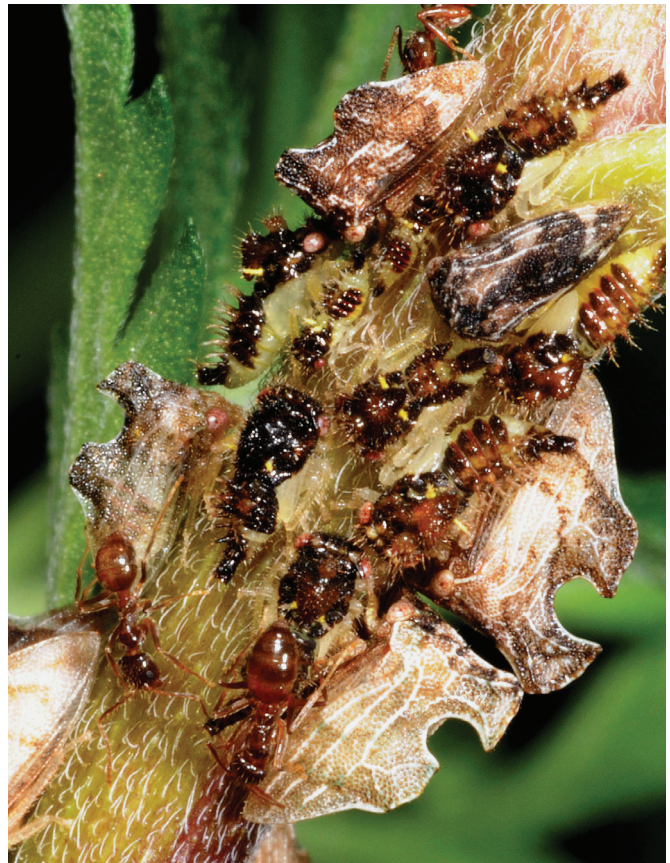
Figure 5. Tawny crazy ants tending honey dew producers.

Being omnivorous, tawny crazy ants eat almost any organic material. Worker ants commonly tend sucking, hemipterous insects such as aphids, scale insects, whiteflies, mealybugs, and others that excrete a sugary (carbohydrate) liquid called honeydew when stimulated by the ants (figure 5). The sweet parts of plants, including nectaries or damaged and overripe fruit, attract workers. Worker ants also consume other insects and small vertebrates for protein.