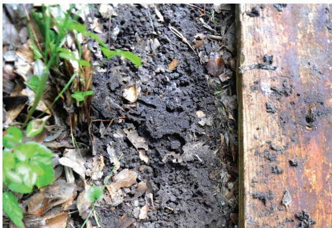
Figure 4. Tawny crazy ant nest under a board in a yard