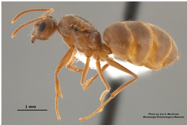
Figure 3. Tawny crazy ant queen, Nylanderia fulva (Mayr).

In areas where tawny crazy ants are well established, workers can number in the millions. Colonies have multiple queens (figure 3) that share reproduction responsibilities, allowing colonies to reach extremely large populations and occupy wide swaths of land. They prefer foraging and nesting in shaded areas. Foraging trails are quite apparent ( \geq 4 in. wide) and individuals forage erratically. Foraging trails will often be found going up and down trees, fences, following seams in concrete surfaces, following structural barriers, and in large open shady grassy areas. Colonies nest in, on, and under anything that can provide moisture and protection from rainfall (figure 4). They have been found in mulch and leaf litter, landscape objects, signs, and structures and under pots, natural debris, and loose tree bark. Nests occur primarily outdoors, but worker ants will forage indoors.