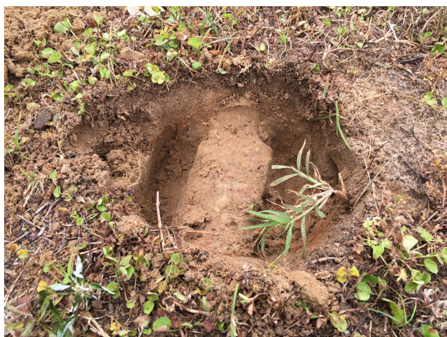
Figure 7. When setting a scissor-jawed trap, dig out a portion of soil around the tunnel.