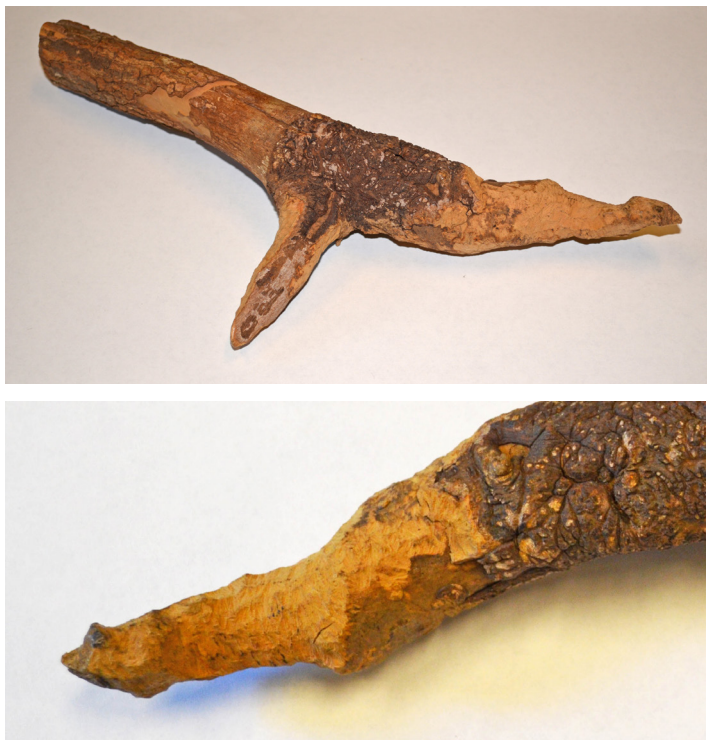
Figure 4. The trunk of a small dogwood with all of the root structure eaten by voles. The homeowner reported that the tree was fine one day; the next day, the leaves were wilting. And on the next day, the homeowner effortlessly pulled the tree out of the ground, and this was all that was left.

Damage by voles may be confused with damage by rabbits. To determine the culprit, look at the gnawing or chewing pattern. Voles have small teeth that leave small, irregular gnaw marks at various angles on the plant (fig. 4). Rabbits have wider teeth that leave wider marks. In addition, rabbits often will cut the plant in two with a uniform 45-degree