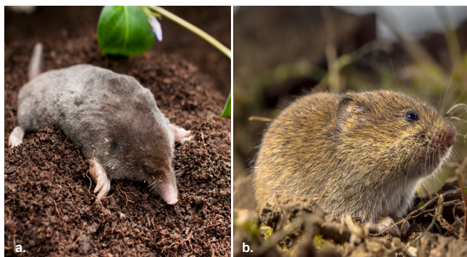
Figure 1. The mole (a) is related to the shrew. It has a long nose and webbed front feet with sharp claws for digging. The vole (b), in the rodent family, is smaller and has a short tail and legs.

Voles are 4 to 6 inches long and have short legs and tails, and small eyes and ears. There are two species native to Alabama. The most common is the pine or woodland vole ( Microtus pinetorum ), which is found statewide in woodlands (figure 1b). The second is the prairie vole ( Microtus ochrogaster ), found only in the northern one-third of the state.