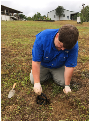
Figure 9. Place the trap so that the jaws will slice through the tunnel and kill the mole. .