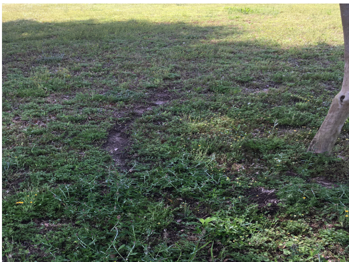
Figure 3. This line of bare ground is where a mole has tunneled through the yard.

If using a harpoon trap, allow the trap to spring into the ground several times before making the final set. This ensures that the