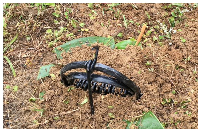
Figure 10. Use the dug soil or leaves to refill areas of the hole. The key is to make sure that no sunlight penetrates into the burrow.