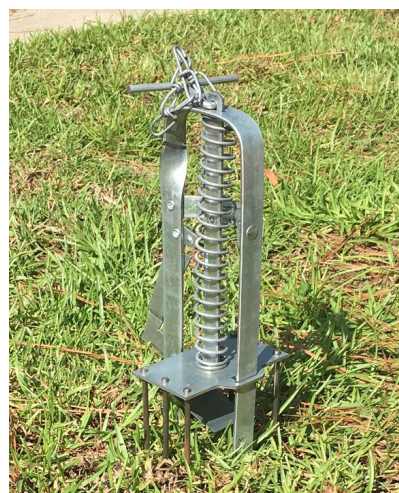
Figure 6. This harpoon trap is set and ready to be placed in the mole tunnel. harpoons can travel through to the tunnel unimpeded.