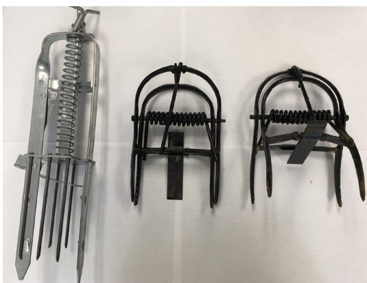
Figure 5 Harpoon traps, left, are effective in sandy soils, and scissor-jawed traps, right, are effective in loamy soils.