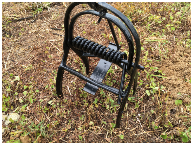
Figure 8. This scissor-jawed trap is set and ready to be placed in the mole tunnel.