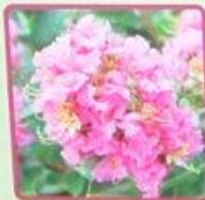
Dazzle™ Me Pink