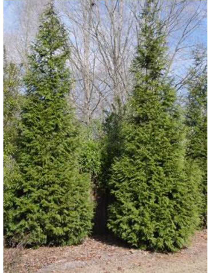
Green Giant Arborvitae (Thuja hybrid)