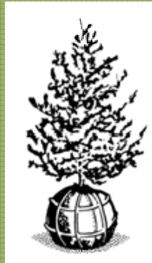
Ball and Burlap (B&B)