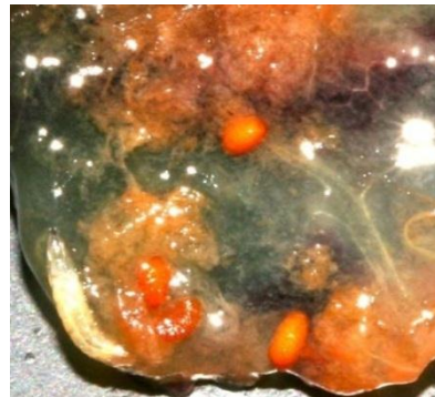
Figure 3. Small, cream-colored SWD maggot feeding inside a blueberry fruit.