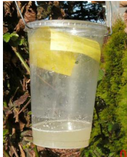
Figure 4. Homemade SWD clear plastic cup trap.

For homeowners or low-budget growers, simple traps can be made from a 16 to 32 oz clear plastic cup and lid, hanger, bait solution, twist-tie or paper clip, and a yellow sticky card (Figure 4).