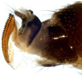
Figure 2. SWD female has a saw-like ovipositor that penetrates the thin-skinned fruits.