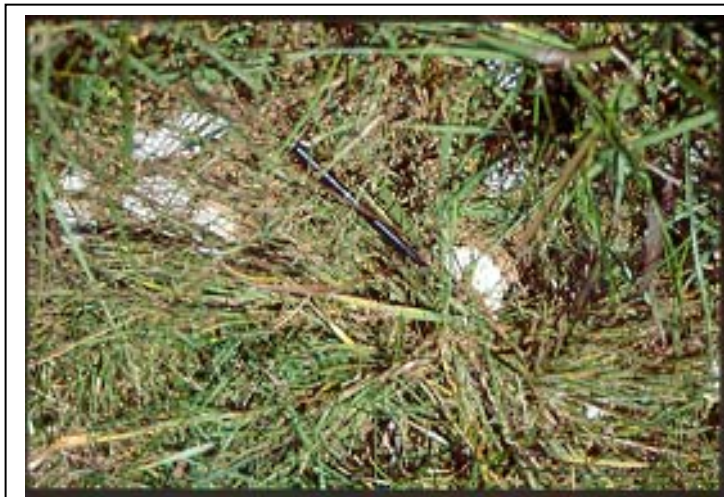
Clumps of lime remain clearly visible in a fescue pasture in North Alabama several months after lime stabilized biosolids were applied.

The all-time high cost of fertilizers has Alabama producers looking at alternatives. One of these is biosolids from municipal waste water treatment plants. At one time, the term, “sewage sludge” was used to refer to all byproducts of waste water treatment. In fact, Alabama Cooperative Extension had a 1991 circular ANR-607 entitled, “Land Application of Sludge”. The term, biosolids, was introduced in 1991, mainly to designate those sludges that were suitable for beneficial use on the land. Britannica Concise Encyclopedia (2008)_ defines