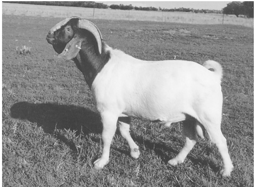
Boer goats are white with a red-horned head and Roman nose. Mature Boer bucks weigh 240 to 380 pounds.

Meat goat breeds in the United States include the Spanish and the Boer. The Spanish goat, sometimes called brush or meat goat, is a mixed breed with widely varying colors and markings. Though relatively small (75 pounds at maturity), Spanish goats are highly prolific and can survive with little care. The Boer goat, originally from the Eastern Cape Province of South Africa, is also prolific with a kidding rate of 200 percent being common. Because of their extended breeding season, Boer goats produce three kiddings every two years. Boer goats, introduced into the United States in 1993,