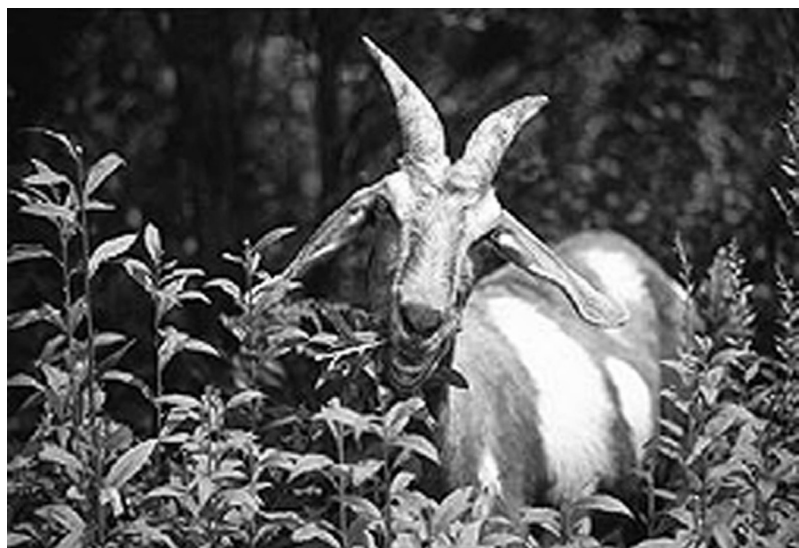
Goats prefer woody and weedy plant species.

allowances, obtain a copy of the National Research Council report titled Nutrient Requirements of Goats , Number 15, 1981. This NRC report can