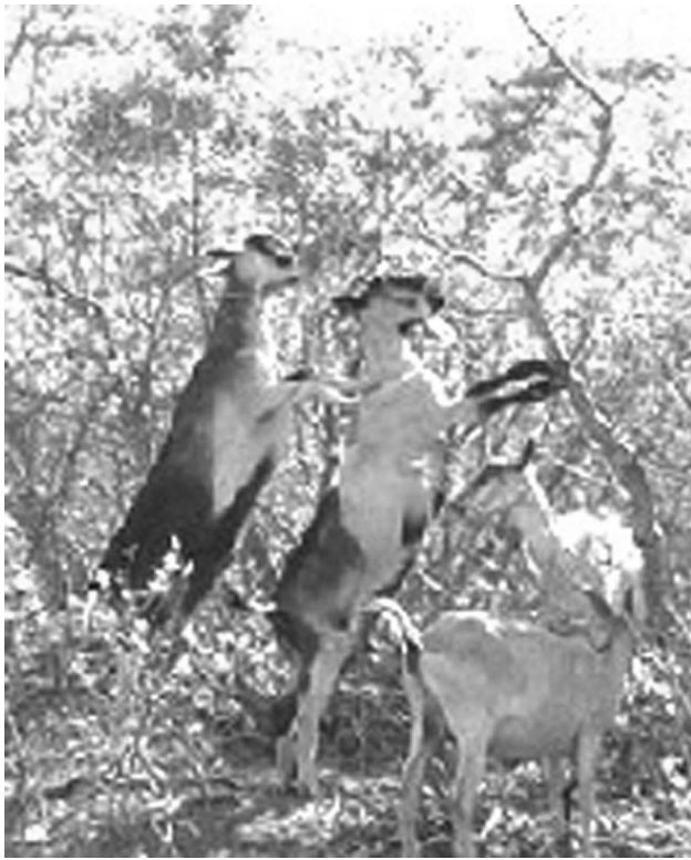
Goats put the bite on brush.

milk production, and retarded growth and abnormal bone development in young kids.