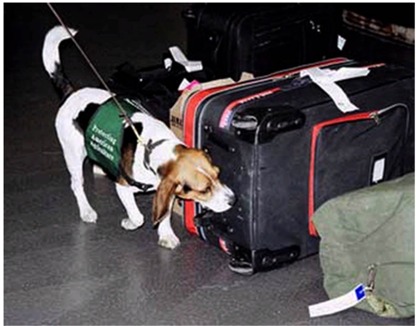
Member of the U.S. Customs & Border Protection Beagle Brigade inspecting luggage for agriculture contraband.

Medical tests have recently shown that specially trained dogs are capable of detecting certain types of tumors in humans.