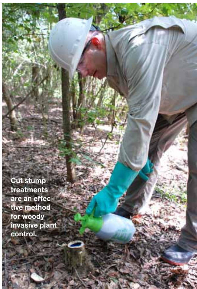
Cut stump treatments are an effective method for woody invasive plant control.

Cut stump treatments can be done almost any time of the year with most woody invasive plants. While late summer through fall is often the optimal time, late fall may be the easiest time from an operational standpoint. Temperatures are cooler, herbaceous vegetation is dormant, and undesirable critters are less active. The only time cut stump treatments should not be done is