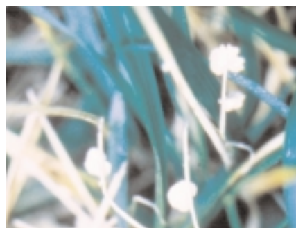
Figure 5. The characteristic mushrooms of the causal fungus of white patch Melanotus phillipsii on dead tall fescue leaf

causal fungus Melanotus phillipsii usually invades only the leaves and not the crown, most tall fescue lawns will begin to recover when weather conditions are more conducive for turf growth (Figure 5).