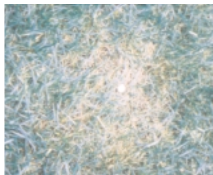
Figure 4. White Patch on a tall fescue lawn. Symptoms are very similar to those of brown patch

diameter of 8 to 12 inches and may merge to form large, irregular areas of damaged turf. Bleaching of the leaf begins at its tip and progresses toward the junction of the leaf and its leaf sheath. A row of three or more tiny gilled mushrooms, usually almost white to light tan in color, will appear along the length of the blighted leaves. Since the