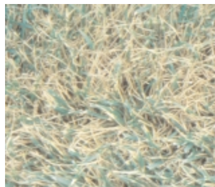
Figure 1. Brown Patch on Kentucky 31 tall fescue

Circular off-color to brown patches ranging from 1 to 3 feet in diameter are the most noticeable symptom of brown patch on tall fescue (Figure 1).