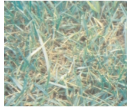
Figure 2. Individual leaf spots on tall fescue have a tan center and gray to brown margin

Small, round gray brown spots appear along the leaves and to a lesser extent the leaf sheaths. As these spots increase in size, their centers turn light brown to gray while the margins are purple to brown in color. At times, a yellow border or halo may surround each spot (Figure 2). Although the spots may appear anywhere along the leaf