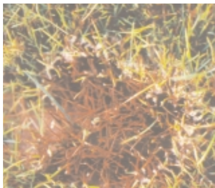
Figure 6. Pythium blight on turf-type tall fescue sod. Note the cottony white growth of the Pythium fungus around the margin of the blighted patch of turf

The early symptoms of Pythium blight include small, circular water-soaked spots, which are several inches in diameter. At first, these spots appear greasy or slimy. As these patches dry, the blighted leaves turn tan to brown (Figure 6). On tall fescue lawns, the blighted patches of turf may reach a diameter of 1 foot and are sunken due to the collapse of the blighted shoots. Often, these blighted patches merge to form large irregular areas of dead turf.