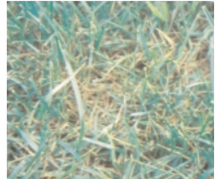
Figure 2. Individual leaf spots on tall fescue have a tan center and gray to brown margin

Small, round gray brown spots appear along the leaves and to a lesser extent the leaf sheaths. As these spots increase in size, their centers turn light brown to gray while the margins are purple to brown in color. At times, a yellow border or halo may surround each spot (Figure 2). Although the spots may appear anywhere along the leaf