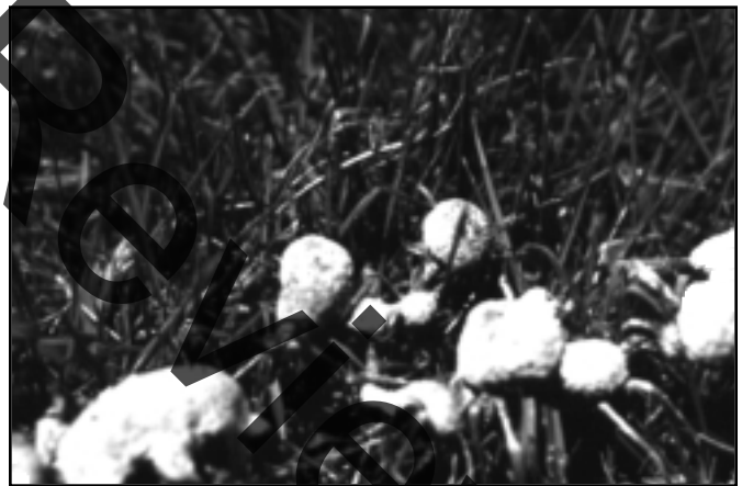
Figure 3. Slime mold on Emerald zoysiagrass

may range from several inches to over a foot in diameter.