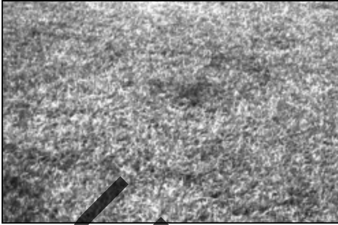
Figure 4. Discolored or "lolly" areas are plasmodium of a slime mold.