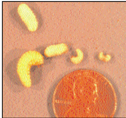
Figure 2. Whitefringed beetle grubs.

inch long and burrow into the soil. They are legless, white or cream in color, and have black mouthparts. Their head capsules are usually not visible. Larvae growing on sweet potato grow quickly into the medium- to large-size stages ( \frac{3}{16} to \frac{1}{2} inch long) that can damage roots (Figure 2).