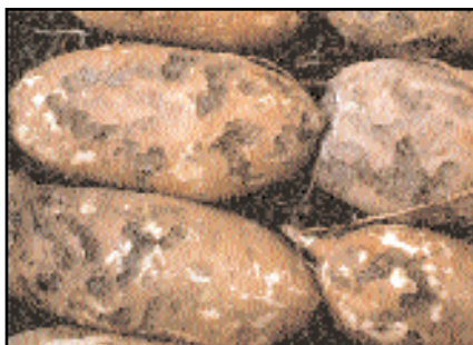
Figure 10. White grub damage to sweet potato.

White grub larvae gouge out broad, shallow areas on the root (Figure 10). The damage is similar to that caused by the white-fringed beetle, but because white grubs are larger, their feeding channels are wider.