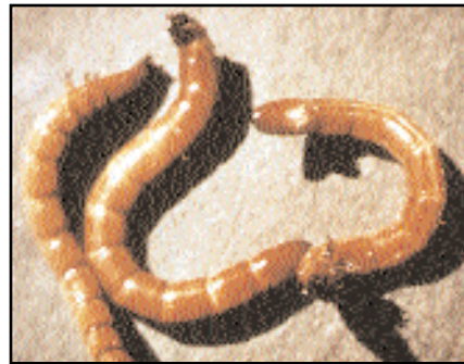
Figure 7. Wireworm larvae.

Adult wireworms are called click beetles and do little foliar feeding. Wireworm larvae live in the soil and cause the damage. The larvae have slender, wire-like, hard bodies, approximately \frac{3}{4} inch long (Figure 7). Colors range from yellow to orange and brown. Some species have as many as 7 to 10 larval stages, and larvae can live up to 4 years in the soil.