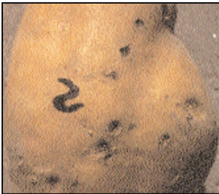
Figure 6. Systema flea beetle damage to sweet potato.

Systema flea beetle larvae eat small holes through the skin of the root. Damage is similar to that caused by cucumber beetle larvae, but holes made by flea beetles are less round and more irregular (Figure 6). Systema adults usually do not cause serious foliar damage. The SPFB adults may reduce sweet potato yields by feeding on foliage. SPFB larvae make small tunnels under the skin of roots; this is often called “writing” damage.