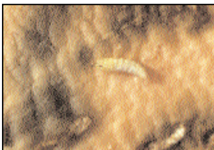
Figure 8. Sweet potato weevil and damage to sweet potato.

Adult sweet potato weevils are antlike in appearance and about 1/4 inch long. The adult head and wing covers are metallic blue, and the thorax and legs are bright orange/red. Sweet potato weevil eggs are laid on vines or roots. Larvae are white and legless, with visible light-brown head capsules (Figure 8).