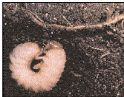
Figure 9. White grub.

White grubs are the larvae of Scarab beetles (such as June and May beetles) that live in the soil and feed on organic detritus and plant material. They have tan or brown head capsules, curved bodies and six legs and can grow up to an inch long (Figure 9). Their bodies are white or whitish cream, and a dark food mass is often visible under the skin at the rear end of the body. They may produce one to two generations per year depending on the species. White grub larvae overwinter in the soil.