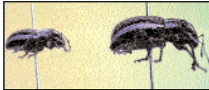
Figure 1. Whitefringed beetle adults.

Whitefringed beetle adults are flightless beetles in the "broad snout-weevil" group. Unlike other beetles, weevils have mouthparts on the end of a long snout. Whitefringed beetles have grey bodies with a white stripe along the side and are approximately 0.4 inch long (Figure 1). Adults, which are all female, emerge beginning in late June in central to north Alabama and begin laying eggs. Egg masses are laid on soil debris and require high moisture for hatching (moist, humid conditions favor development). Hatching larvae are less than \frac{1}{16}