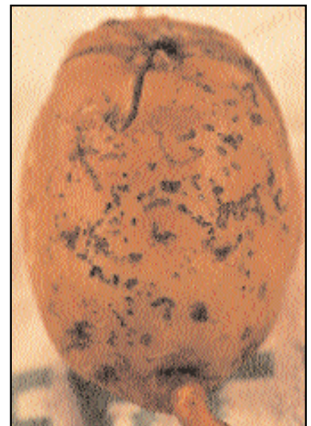
Figure 3. Whitefringed beetle grub feeding damage to sweet potato.

sweet potato roots before harvest. Grubs hatching later in the season will overwinter in the soil and resume feeding and development the following season. The appearance of larval feeding on roots is varied. In central to north Alabama, most damage occurs late in the season (around early September) after roots have enlarged. Grubs often chew a shallow gouge or channel ( \frac{1}{8} to \frac{1}{2} inch wide) across the surface of the root (Figure 3). Grubs may also bore straight into the root, creating a fairly deep, circular scar. Depending on the size of the hole, this damage is similar to that caused by wireworms or cucumber beetle larvae.