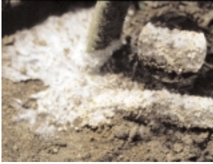
Figure 10. White fanlike fungal growth (mycelium) on lower stem and surrounding soil. On right, close-up of mycelium and sclerotia.