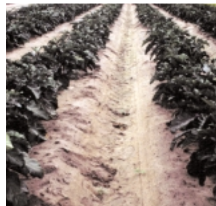
Figure 1. Bare ground production of eggplants. Note: field is weed-free with healthy, green eggplants.

Eggplant can be successfully grown in most soils in Alabama (Figure 1). Avoid low, poorly drained soils. Well-drained sandy loam, loam, or clay loam soils with a pH of 6.0 to 6.5 are best for growing eggplants. A good supply of organic matter is desirable. Cover crops should be plowed under at least 1 month before planting to allow time for the cover crop to decompose. To avoid potential soilborne disease and nematode problems, plant eggplant in soils that have not grown a crop of tomatoes, peppers, Irish potatoes, or eggplants in the past 2 to 3 years.