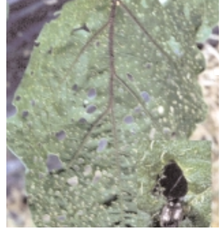
Figure 7. In the background, characteristic "shotgun" feeding damage by flea beetle adults. On right, close-up of adult flea beetle.

Flea beetle adults overwinter in crop and weed debris, so plowing crop debris under in the fall reduces the potential for infestation in the spring. Kill weeds bordering and within the field to remove alternate host plants for flea beetles. In areas where flea beetles are a consistent problem, consider protecting plants with row-cover material.