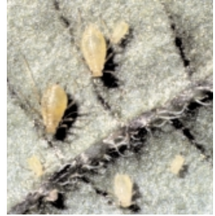
Figure 5. Aphids (nonwinged forms) on underside of eggplant leaf

One way to control aphids is to control weeds in and around fields because numbers of aphids can build up on weeds and move onto young plants. Also, avoid overfertilizing with nitrogen because high levels of nitrogen favor aphid reproduction. Aluminum foil or reflective mulches have been successfully used to repel invading aphid populations. In a small area, aphids can be dislodged from plants with a strong water spray, which can be made more effective by adding 2 to 3 tablespoons of liquid dishwasher detergent per gallon of water. Commercial formulations