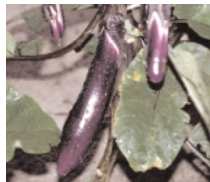
Figure 3. Close-up of specialty eggplant