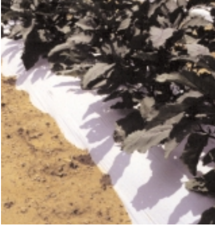
Figure 4. Commercial planting of eggplants on white polyethylene mulch. Large, vigorous plants sometimes require staking to support them as they develop a heavy fruit load. To avoid this problem, perform a soil test, and do not overfertilize.