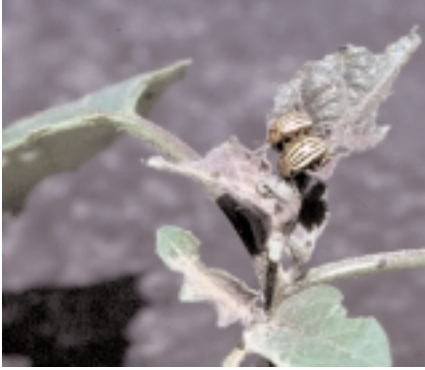
Figure 6. Colorado potato beetle adults feeding on eggplant

available. Both adults and larvae are foliage feeders, feeding only on fruit when foliage is not available. Severe defoliation can result in loss of yield, with the degree of yield loss depending on the general health and growth stage of the plants (Figure 6).