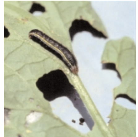
Figure 8. Beet armyworm and characteristic feeding damage