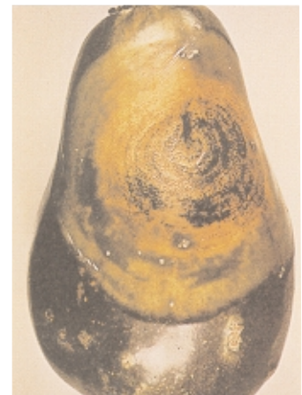
Figure 9. Large, circular lesions on fruit. Note concentric pattern.