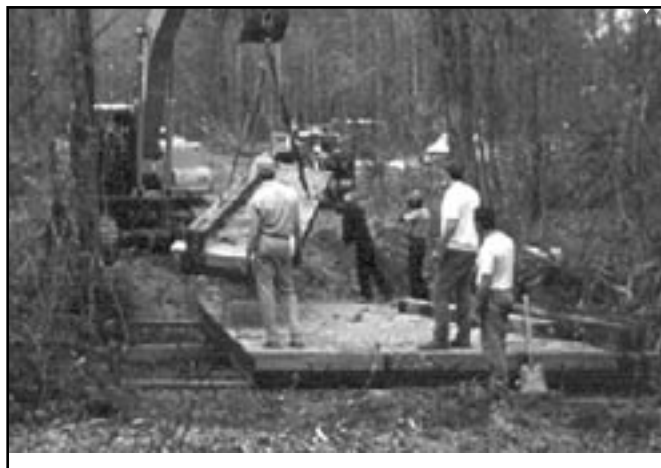
Figure 4. Placing bridge deck panels.

Installation of the bridge usually requires some site work with a bulldozer or excavator. You want to try to get the floor of the bridge as level as possible, so it is best to use a construction or engineer's level to insure that the sills are at the same elevation before you set the first panel in place. The panels can then be lifted into place with a knuckleboom loader, backhoe, or crane truck using nylon slings, chains, or wire rope as shown in Figure 4.