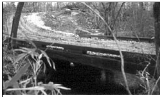
Figure 6. Finished bridge installation.

The time required to install the glulam bridge is about 6 hours. After the crossing is no longer needed, the bridge can be removed in reverse order of the installation. Removal time is approximately 3 hours. There may be some