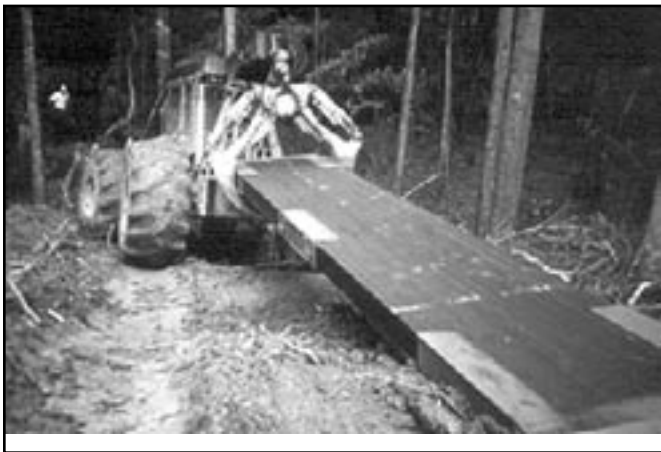
Figure 2. Use of grapple skidder to place glulam bridge

Through research at Auburn University, several variations of these types of bridges have been designed and tested. These include bridges for off-highway vehicles such as log skidders as well as several different types of bridges for log truck traffic. The lengths of these bridges range from 26 feet for the skidder bridge up to 40 feet for the largest truck bridge. The skidder bridge is the simplest design and consists of two glulam panels 4 feet wide by 26 feet long by 8½ inches thick. The two panels are laid side-by-side directly on the stream banks with a gap approximately 2 feet wide between the panels. To simplify the installation and removal, the panels are not connected to each other. The panels are skidded to the stream crossing site by the skidder and then they can be easily set in place using the skidder grapple as shown in Figure 2.