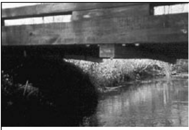
Figure 3. Transverse stiffener beams attached to bridge deck panels.

The stiffener beams are also made of creosote treated glulam beam 6\frac{3}{4} inches wide by 5\frac{1}{2} inches thick by 16 feet long.