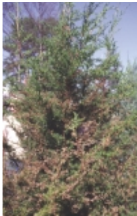
Figure 1. Severe Phomopsis tip blight on red cedar