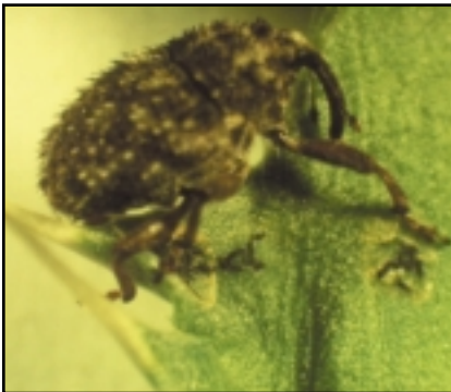
Figure 6. Rosette weevil