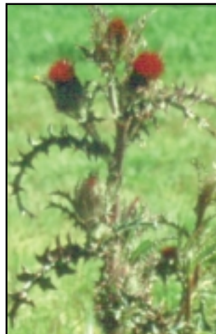
Figure 3. Yellow thistle