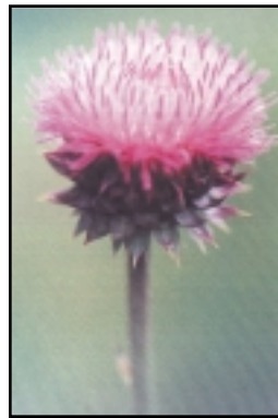
Figure 1. Musk thistle

In Europe and western Asia, where thistles originated, insects have been discovered that selectively feed on particular kinds of thistle. These insects, once evaluated, have become useful biological control agents, because they can be released into a new environment with little chance of harming other plants. Musk thistle is attacked by