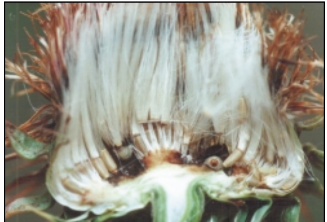
Figure 8. Thistle head weevil grubs