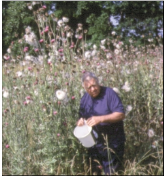
Figure 11. Field with a dense stand of musk thistle.

In 1992, a program was begun to establish beneficial insects for control of musk thistle in Alabama pastures. The thistle head weevil has been established in Franklin, Colbert, Limestone, Marshall, Tallapoosa, Calhoun, Lauderdale, Talladega, and Chambers Counties. A field in Chambers County that had a dense stand of musk thistle (Figure 11) was chosen for the first release of weevils in 1992. Four years later, there were fewer thistles in the field (Figure 12).