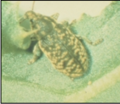
Figure 5. Thistle head weevil