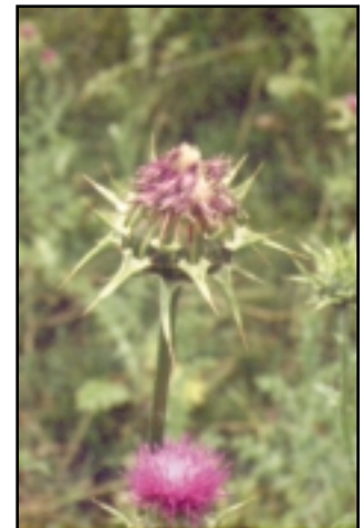
Figure 4. Milk thistle

at least ten different insects. Two of these species, the thistle head weevil, Rhinocyllus conicus (Figure 5) and the rosette weevil, Trichosirocalus horridus (Figure 6), show promise for use in Alabama.