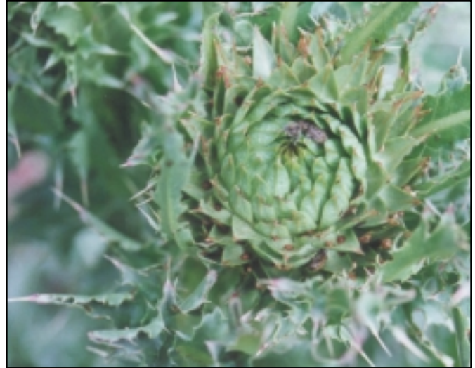
Figure 7. Thistle head weevil adults (dark brown) lay eggs (light brown bumps)