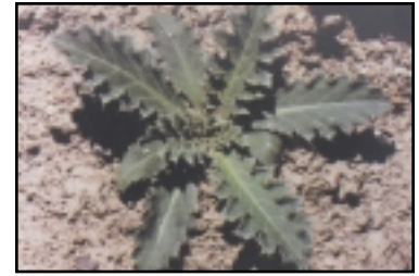
Figure 2. Musk thistle rosette