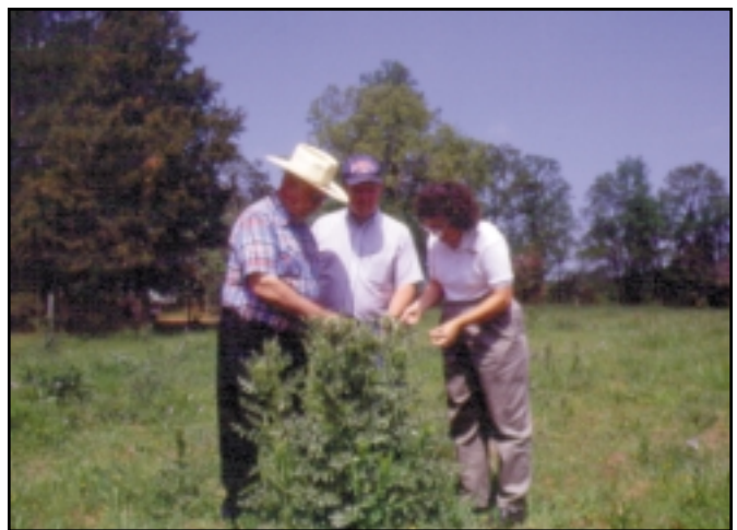
Figure 12. Same field 4 years later with fewer thistles