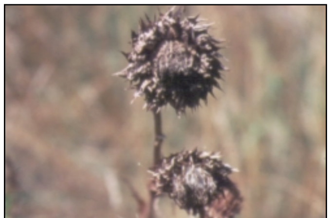
Figure 9. Infested musk thistle flower heads

Infested flower heads produce few seeds (Figure 9). The more insects present inside the head, the fewer seeds produced. Fifteen weevil grubs per head will prevent all seeds from forming in that head. Seasonal activity of the head weevil is