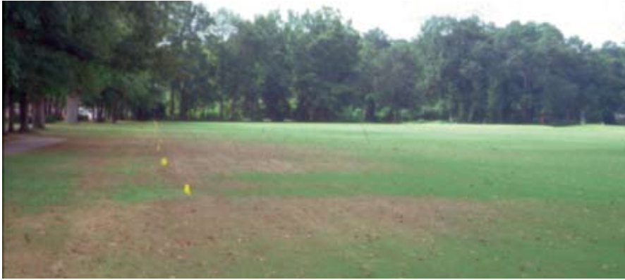
Figure 2. Fall armyworm damage on closely mowed grass. Note brown patches resembling drought damage.