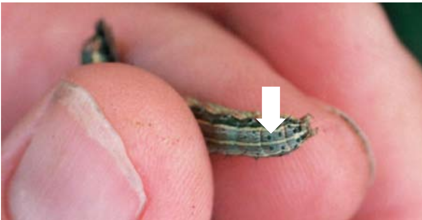
Figure 5. Fully grown fall armyworm larva. Note set of four dots on the end of the abdomen.

Pupae. Development from egg to fully grown larva requires about 2 to 3 weeks. At this point, larvae burrow into the soil and form pupae. The moths emerge in about 10 to 14 days.