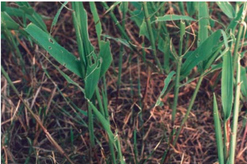
Figure 3. Fall armyworm damage in a hayfield. Caterpillars have eaten the tender, green portions of the grass, leaving jagged leaf edges and tough leaf bases.

Fall armyworm damage on newly established grasses including winter annuals, tall fescue, or orchardgrass can be an even more serious situation. Seedlings of these fall-seeded plants are small when popula-