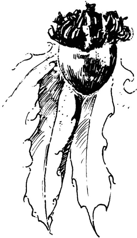
Sawtooth oak leaves and acorns.

with a wire cage made from 2- × 4-inch welded wire. Build cages 1 foot in diameter and 4 feet high, and hold them upright with a 5½-foot-long piece of No. 3 rebar driven into the ground. Tree shelters (plastic, transparent grow tubes) not only protect young trees from deer browsing (and antler rubbing) but also greatly accelerate tree growth. The one draw back of tree shelters is their cost.