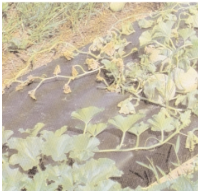
Figure 7. Cantaloupe infected with bacterial wilt.

Bacterial wilt is characterized initially by wilting and drying of individual leaves. Within a day or two the wilting symptoms spread to leaves up and down a runner (Figure 7). The bacteria spread within the plant from infected runners to the main stem and then to other runners. The entire plant collapses eventual-