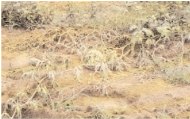
Figure 1. Watermelon infected with Fusarium wilt.

Fusarium wilt of watermelon is caused by the fungus Fusarium oxysporum f. sp. niveum . The fungus also attacks summer squash but not cantaloupe or cucumber. Plants infected early in their development often damp-off at the soil line. Older plants may first exhibit temporary wilting only during the heat of midday but will die within a few days (Figure 1). Wilt symptoms develop in one or more lateral vines,