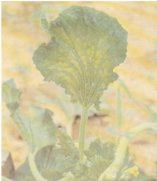
Figure 13. Malformed, mosaic-virus-infected leaf on squash.

Squash mosaic virus (SqMV) affects most cucurbits but is rarely a problem in watermelon. Initial symptoms on squash include yellow spotting of the younger leaves. Infected leaves cup upward and develop a light-to dark-green mosaic pattern. Squash leaves may