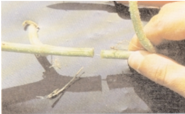
Figure 8. Positive bacterial ooze test for bacterial wilt.

2. Cut two stem sections from near the crown of a recently wilted vine. Squeeze sap from the cut stem ends and press the two ends together. Continue to squeeze, then slowly draw the two sections apart. The presence of a thin, sticky, white strand or strands between the two sections is a positive test for bacterial wilt (Figure 8).