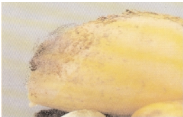
Figure 6. Pin-cushion symptom of wet rot on squash.

Wet rot, caused by the fungus Choanephora cucurbitarum , is a fruit rot of summer squash. Fruits rot rapidly and fungal mold appears on the infected area. The fruit resembles a pin cushion with numerous small, black-headed pins stuck into it (Figure 6). Initially, the heads are white to brown but turn pur-