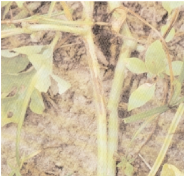
Figure 5. Gummy stem blight lesion on watermelon vine.

become pale brown to gray with time (Figure 5). Stem tissue often cracks and a characteristic gummy ooze exudes from the wound. Infected vines die eventually, and entire plants die occasionally. The disease, unlike anthracnose, does not attack fruit.