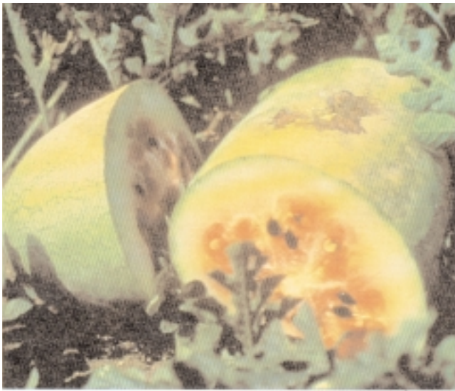
Figure 10. Fruit blotch lesion on watermelon.

alternate hosts. Seed harvested from infected fruit often harbor the pathogen. Undetected infestations can spread rapidly in transplant houses, resulting in high numbers of infected transplants going into fields. Volunteer watermelons act as hosts in fields that were infested with blotch the previous year.