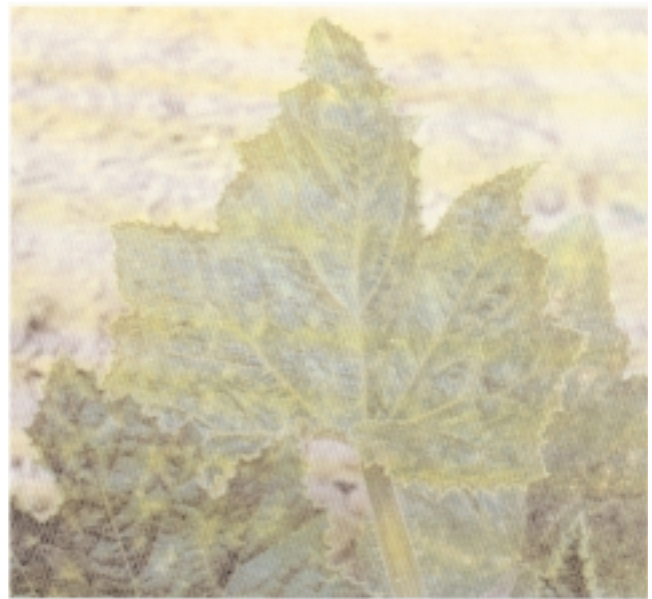
Figure 11. Mosaic symptom on squash leaf.

Cucumber mosaic virus (CMV) attacks more than 40 families of plants worldwide, including all vine crops. Strains of CMV differ in their host range, symptoms, and method of transmission. Cucurbits are susceptible at any stage of growth. When plants become infected in the 6- to 8-leaf stage, symptoms first appear on the youngest, still expanding leaves. A mosaic pattern develops—healthy, dark-green leaf tissue intermingled with light-green and yellow tissue (Figure 11). Leaves are often distorted, crinkled, curled, and stunted. Vines may appear bunched because of the shortening of the internodes. In severe cases, older leaves may die. Typical mosaic symptoms develop only on actively growing leaves. When