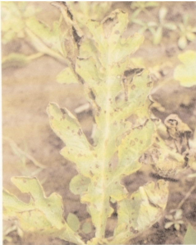
Figure 2. Anthracnose leaf spot on watermelon.

sections of the leaf. These areas become dry and tear away, typically giving the foliage a ragged appearance. Often the leaves at the center of a plant are attacked first, leaving the stem and runners bare. Tan-to-black, elongated, slightly sunken streaks (cankers) form on petioles and stems that can girdle the vine, causing death of the tissue beyond the lesion.