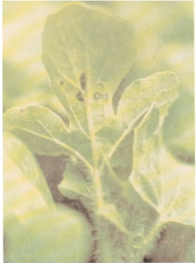
Figure 9. Fruit blotch lesions along midrib of leaf.

The fruit blotch bacterium can cause a seedling blight, leaf spot, and a fruit disorder. Initial symptoms on seedlings consist of dark, water-soaked areas on the lower surface of cotyledons and leaves. Lesion development is often accompanied by a yellow halo. Lesions may form on the hypocotyl, causing death of the plant. Foliar symptoms can occur throughout the growing season but are difficult to detect. Leaf lesions, which act as a reservoir of bacteria for subse-