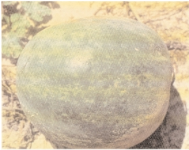
Figure 12. Mosaic symptom on watermelon.

CMV can infect more than 800 species of plants, including many weeds found in Alabama. These weeds can act as reservoir hosts and allow the virus to overwinter. CMV can be spread and transmitted by more than 60 species of aphids. Transmission is in a nonpersistent manner, meaning that the aphids need to feed on a CMV-infected plant for only a few seconds to pick up the virus.