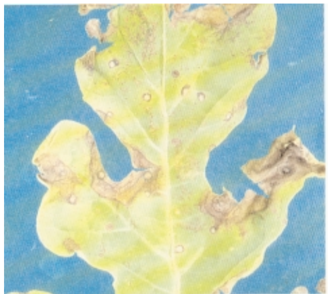
Figure 4. Gummy stem blight leaf spot on watermelon.

Gummy stem blight, caused by the fungus Mycosphaerella melonis , is a common disease of cantaloupe, watermelon, and cucumber. Symptoms first appear as grayish-green, circular spots between the veins in the lobes of leaves. Spots turn a dark brown to black with age (Figure 4). The leaf-spot stage can be confused with anthracnose, however, gummy stem lesions are darker with target-like or zonate patterns and less deterioration of the leaf tissue. Disease spread begins in the center of the plant and spreads outward. Lesions develop first on the vines at the nodes and elongate into water-soaked streaks that