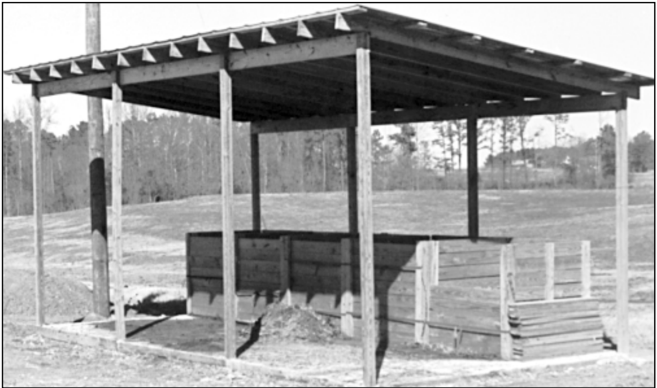
Figure 2. Mini-composting structure with compost boxes.