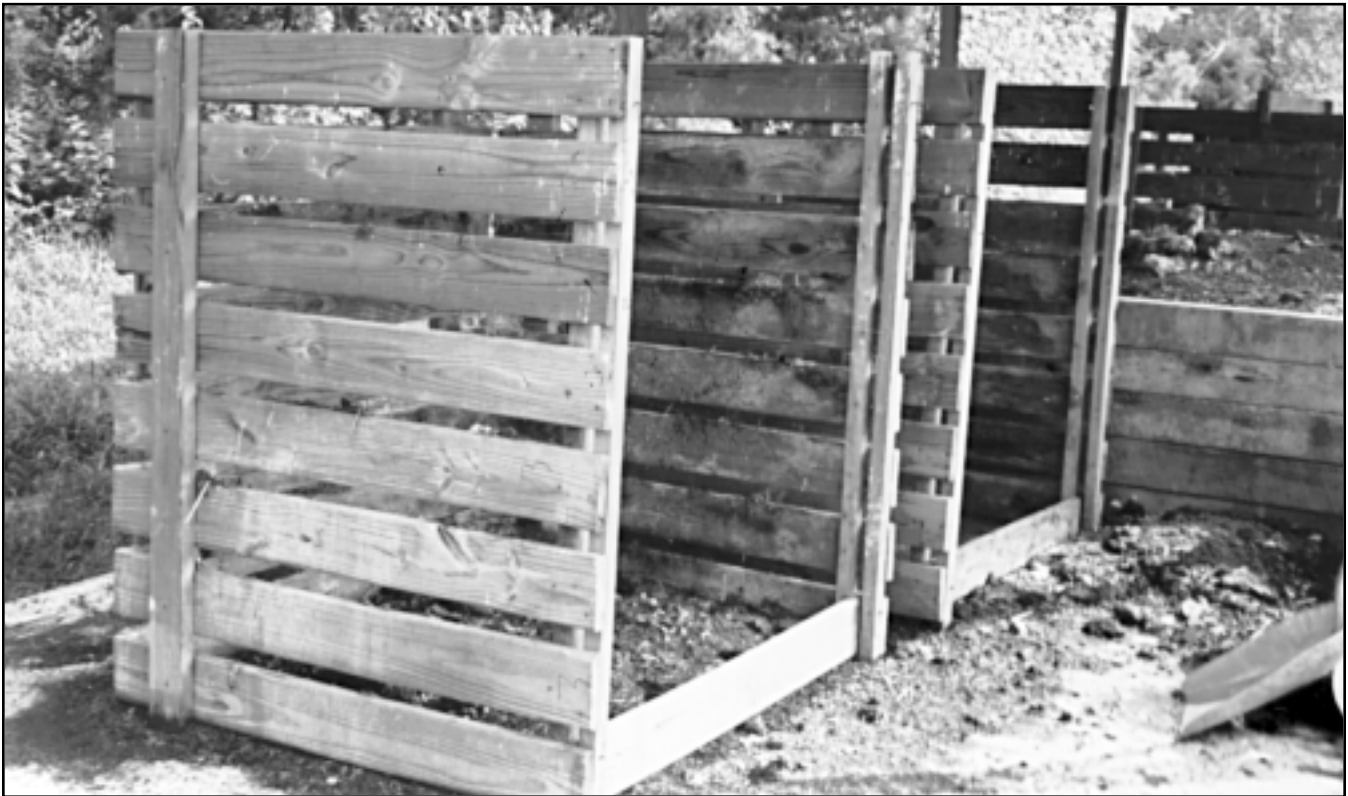
Figure 1. Small-scale composting boxes with fronts removed.

average 20,000-bird house requires four to five compost boxes to handle normal bird mortality. Small-scale composting cannot accommodate the carcasses from larger die-offs. Larger die-offs require other disposal methods.