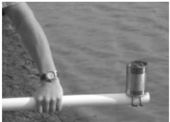
Figure 1. A simple sampler for collecting mud from a full pond