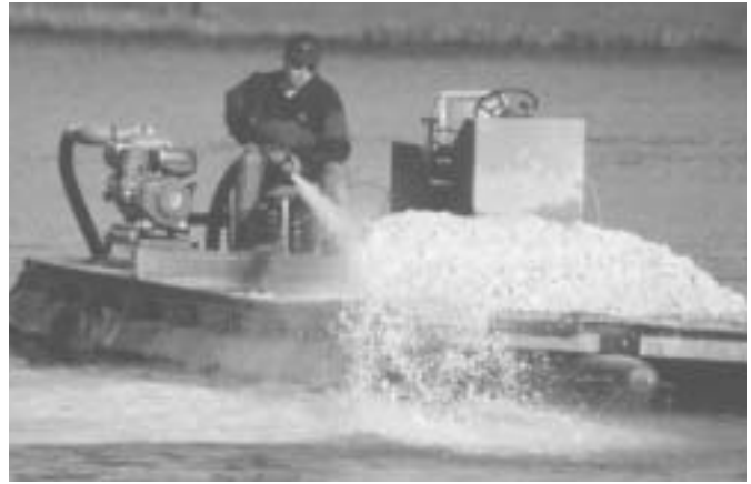
Figure 2. Broadcast agricultural limestone from a barge.

Difficulty of application is the only drawback to the use of agricultural limestone in ponds. Application of 2 tons or more per acre to full ponds requires that the lime be spread from a barge in all but the smallest ponds (Figure 2). Without the aid of heavy machinery, spreading enough limestone to fully neutralize the soils of the pond bottom can be backbreaking work. Many private pond consultants have the proper equipment to lime large ponds for a reasonable fee. For small ponds, less than about 3 acres, the lime can be spread from the shore if the spreader can approach the pond at several points around the shoreline so the lime will contact the entire pond bottom.