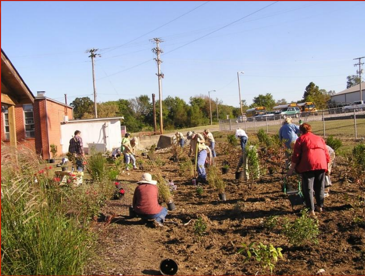
Shoals Area MG's install a rain garden at Anderson School.