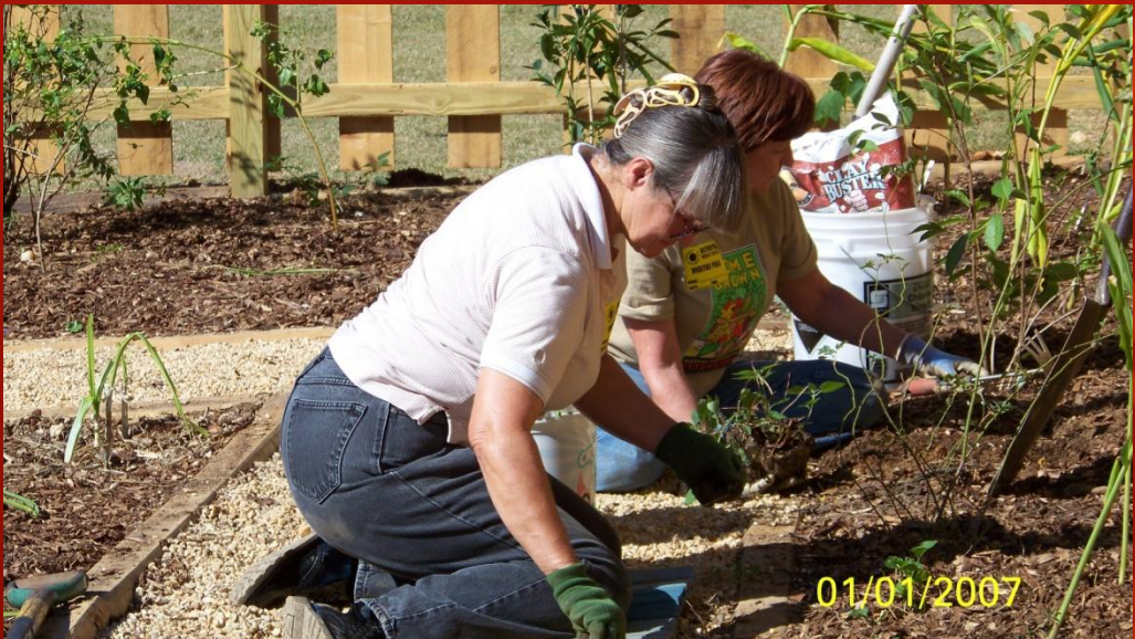
Central Alabama MG's install a garden project at Wetumpka Middle School.