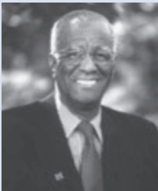
"Famous" Wally Amos Keynote Luncheon Speaker