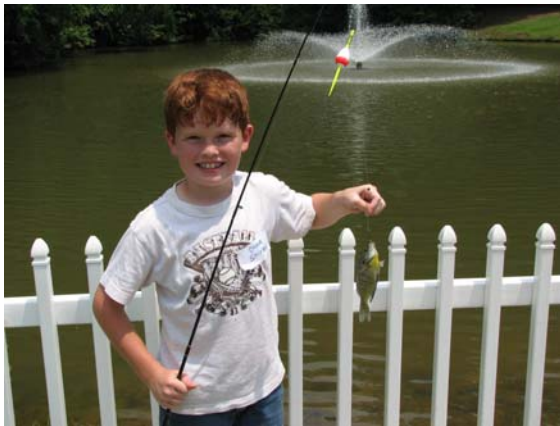
Chase caught 12!

Issued in furtherance of Cooperative Extension work in agriculture and home economics, Acts of May 8 and June 30, 1914, and other related acts, in cooperation with the U.S. Department of Agriculture. The Alabama Cooperative Extension System (Alabama A&M University and Auburn University) offers educational programs, materials, and equal opportunity employment to all people without regard to race, color, national origin, religion, sex, age, veteran status, or disability. Visit our website at www.aces.edu/StClair .