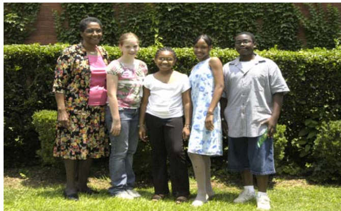
Perry County Youth 4-H District Round-up

The 4-H and Youth Development Program for Perry County will strive to introduce and implement new and innovative programs for the youth in the county for 2006.