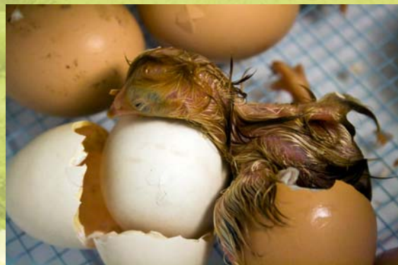
Hatched chick from 4-H program with PEAK Home School