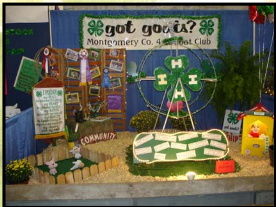
Got Goats? 4-H Club Exhibit

Montgomery County 4-H will have an exhibit booth at the Alabama National Fair. Last year Got Goats? 4-H Club had a fair exhibit. Be sure while you are at the Alabama National Fair to stop by and see the new exhibit from Montgomery County 4-H. Also some of you may be interested in entering items in the many contests that the fair has to offer. Go to the Alabama National Fair web site to see all the different contest you can enter. http://www.alnationalfair.org/home/