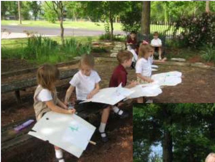
Above- Forest Avenue children enjoy painting scenes from Lilly’s Garden.