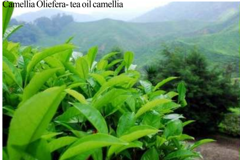
Camellia Oleifera- tea oil camellia

When planting lettuce, using a row cover will help extend the time required to grow lettuce in the Montgomery area. Other cool season veggies such as carrots, beets, collards, turnips, cauliflower and onions can also be planted. Cold frames are useful in getting an early start on seedlings, just be sure to watch the temperatures so plants do not get exposed to extreme heat or cold.