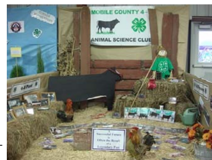
Exhibit take down date—November 2. Items cannot be removed until this date.

NOTE: I will NOT be responsible for removal of any items from the Fair Exhibit.