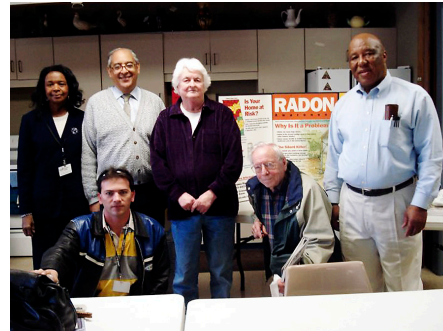
A community radon meeting in North Alabama

Radon is a particular concern in North Alabama where 15 counties are located in Radon Zone 1 and are considered to have the highest potential for elevated