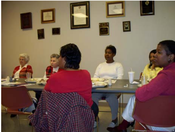
County Health Council Meeting

-Offered three New Leaf Series classes taught weekly for 10 weeks. There was 9 in the morning class, 8 in the afternoon class and 14 in the evening class, making a total of 31 adults (male and female) attending these classes to learn to eat healthy and lose weight.