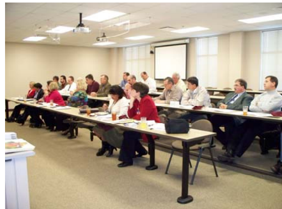
Job Readiness Meeting