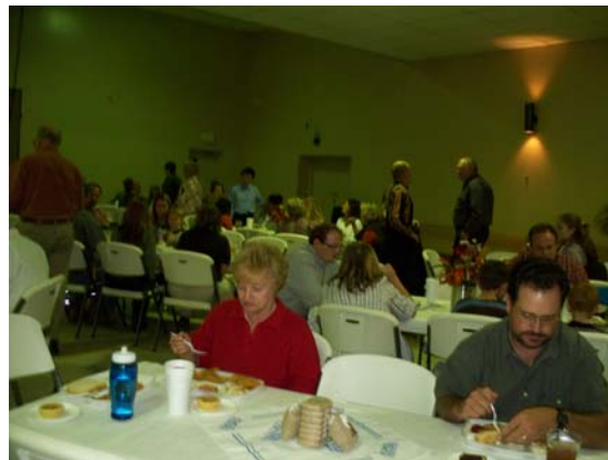
Farm City Week Appreciation Dinner