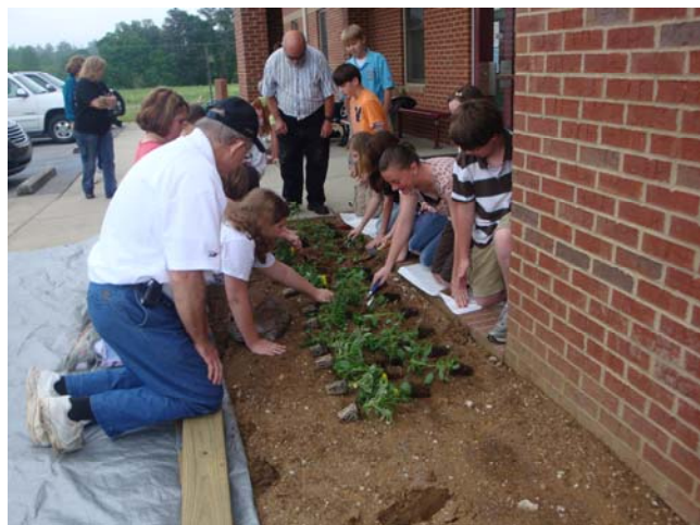
4-Her's and Cherokee County Master Gardeners worked together to beautify Sand Rock School.