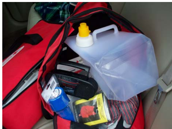
Emergency Preparedness Kit CRD

-We also adopted "Toys for tots" as a project. Over 35 gifts were presented to the local Optimist Club in 2008.