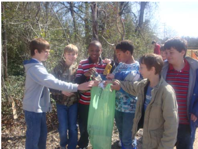
4-Her's at Cedar Bluff School wanted to do a community service project and chose to Go Green on Earth Day by picking up garbage on their school grounds.