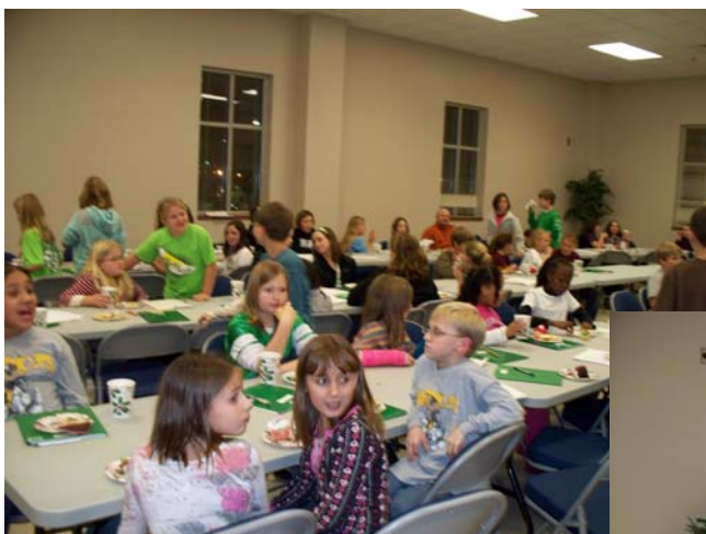
4-H Officer Training Workshop