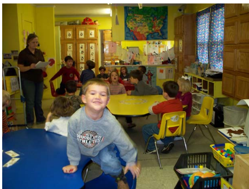
Early Learning Centre children