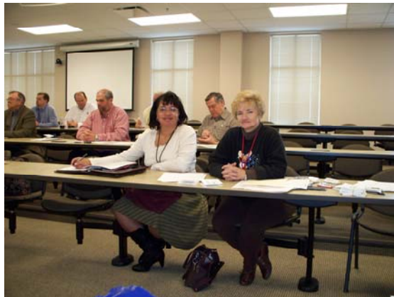
Job Readiness Meeting