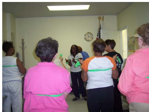
New Leaf Series Class Exercising