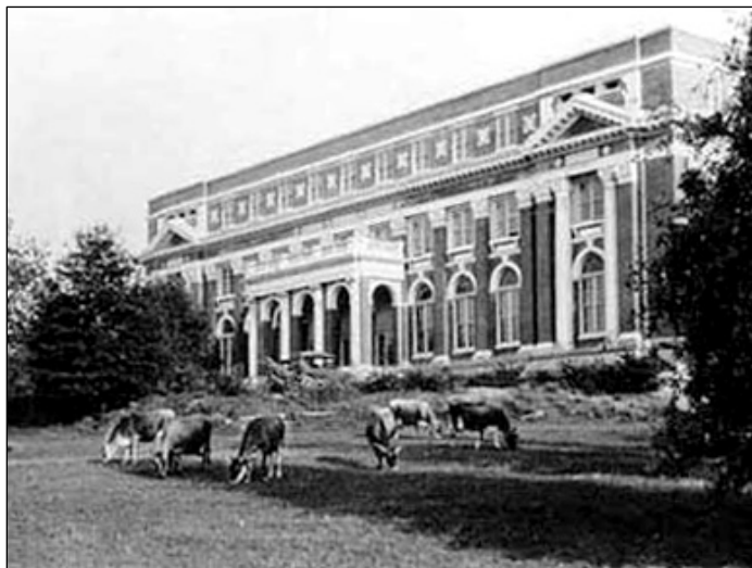
Comer Hall, 1924