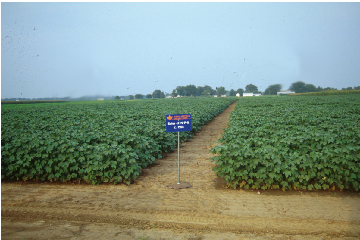
The Rates of NPK Experiment at the Tennessee Valley R&E Center near Belle Mina.