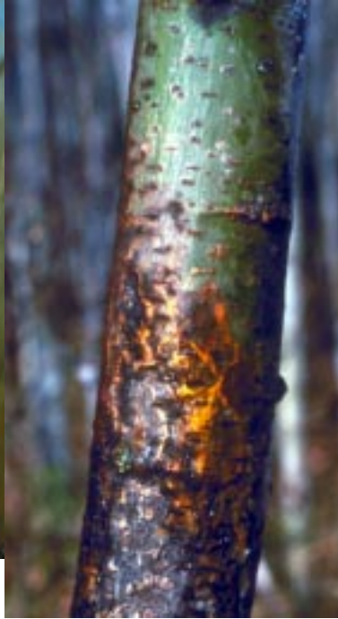
Univ. of Georgia