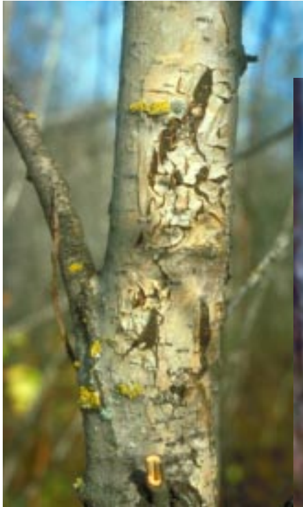
Univ. of Georgia