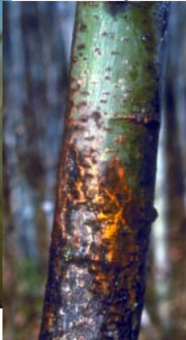
Univ. of Georgia