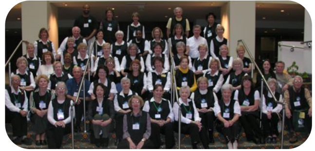
CCMGA at AMGA Conference

All of the members of the Capital City Master Gardener Association are to be commended for a job well done.