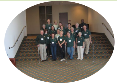
19 Shelby County MGs attended the State Conference.