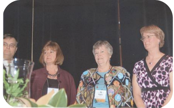
Incoming & Outgoing Board Members. Thanks for your service!