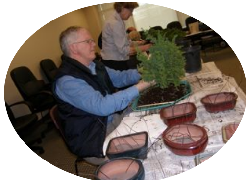
A participant at the hands-on Bonsai Workshop.